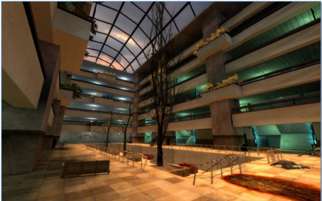
Figure 8 - A shot of the dusk lighting pouring in on the courtyard area.

Aesthetically I was going for the look and feel of an office building that the people abandoned it shortly after the Combine showed up. Structurally I created a large atrium with a fairly large courtyard in the middle. Filling this space with the appropriate amount of clutter and detail was a significant challenge. At times I struggled with not making the area feel too cluttered while still portraying the fact that it people once used it for business purposes. The designers at Valve did a magnificent job of making of making their spaces feel populated while using a minimum amount of clutter, static meshes, and decals and I wanted to find that balance.