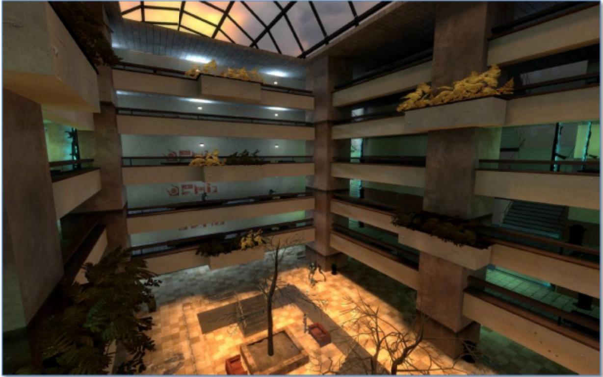
Figure 9 - An upper-center shot of the atrium.