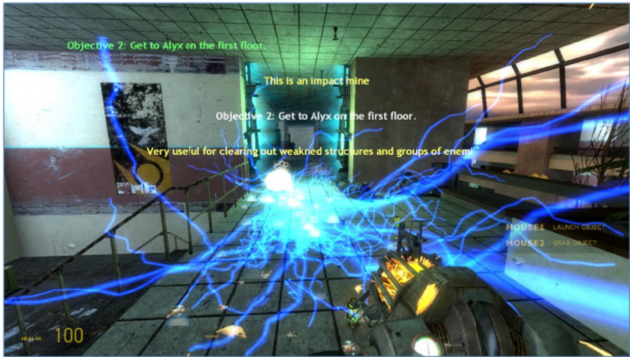
Figure 1 - A quick shot from the Half-Life 2: Episode 2 level, "It's Mine!"

This mini-portfolio is intended to show off my latest work, "It's Mine!" a level created in Half-Life 2: Episode 2 as well as some other work that I have created.