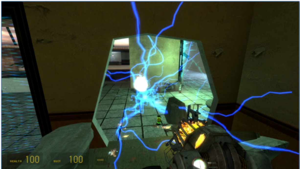
Figure 3 - A shot of the destructive power the Impact Mine is capable of. A brief note explaining the mine's capabilities gives the player a hint on what to do next.

The biggest strengths of Half-Life 2 are the physics and the entity based scripting system. I wanted to create something exciting using the destructive capabilities of the physics while restricting players to use of only the Gravity Gun. This led to creating of The Impact Mine, a destructive object capable of breaking through weakened structures and handling large groups of enemies. The main challenge was setting up the breakable walls and the Impact Mine so that each would interact as smoothly as possible. I also had to script an event that would return the Impact Mine to the player, as it was very easy to lose track of the mine.