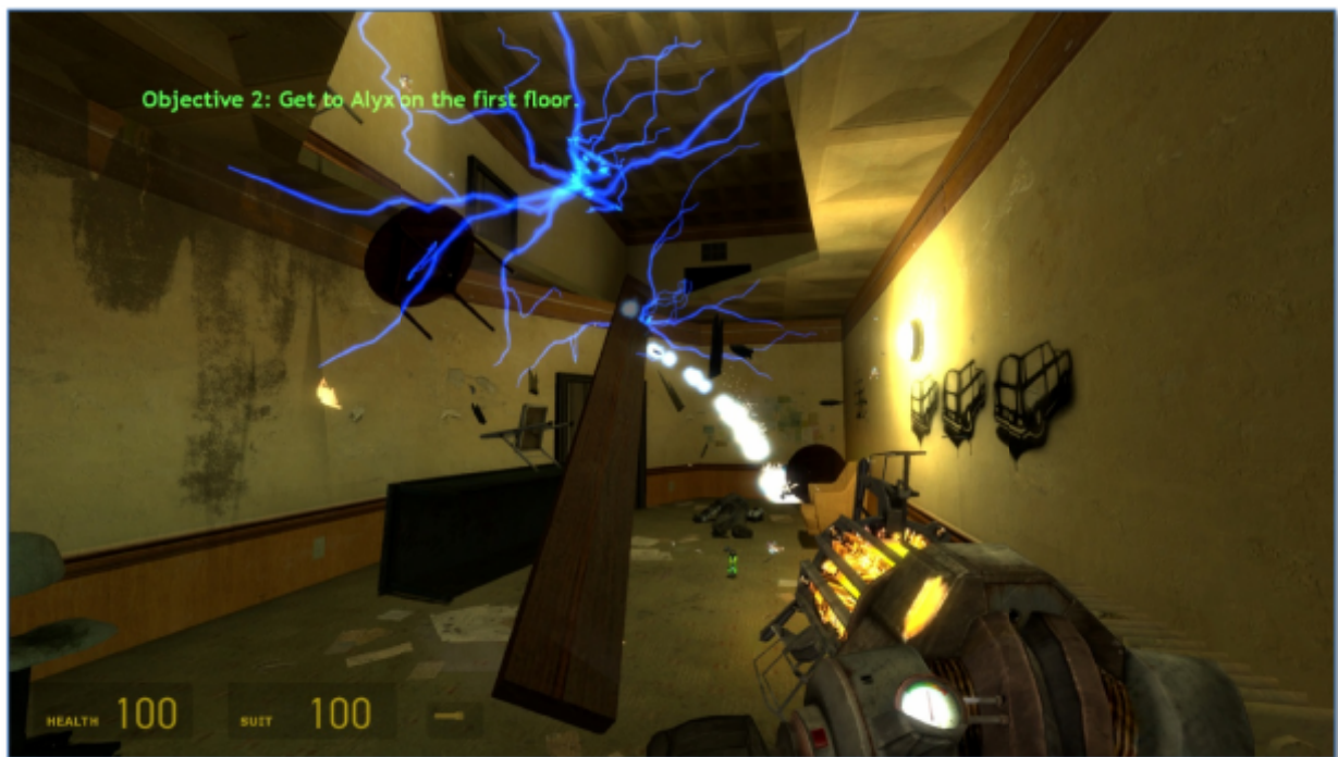
Figure 5 - Here the player must use the mine to bust through a weakened ceiling to climb up.

Designing an area to take advantage of the Impact Mine was also a challenge. I experimented with a couple of different layouts but in the end, I settled upon a large atrium. This allowed for a tight flow in a large structure while allowing room for a good deal of verticality. The player would traverse up and down multiple floors, taking on Combine forces while busting their way through walls and ceilings to reach the first floor and save Alyx from Hunters.