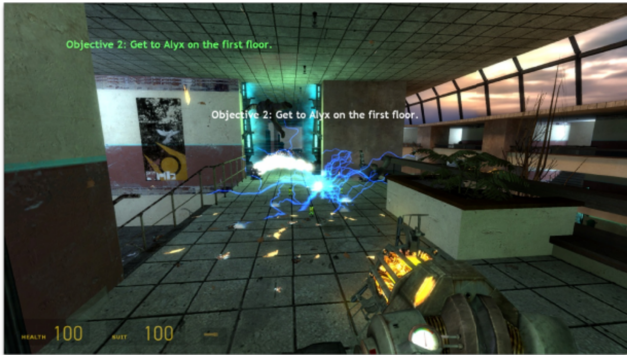
Figure 4 - Another demonstration of the mine's abilities. Here the player must take out a couple of Combine soldiers.