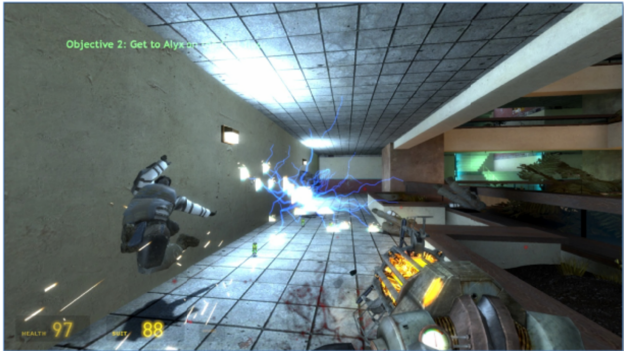
Figure 7 - A group of Combine soldiers attempting to impede the player's progress.