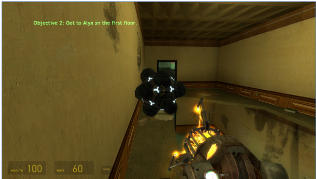
Figure 6 - The player makes their way to one of the upper floors using the Impact Mine.